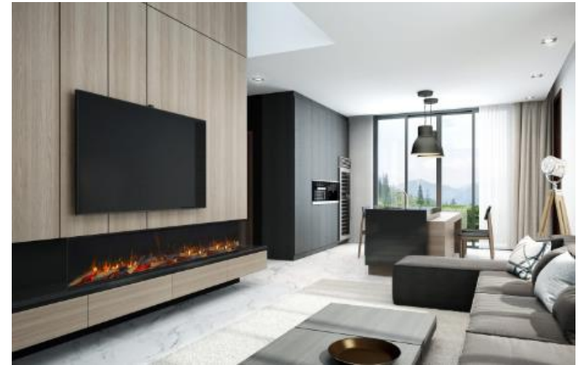
CORNER LEFT/RIGHT GLASS